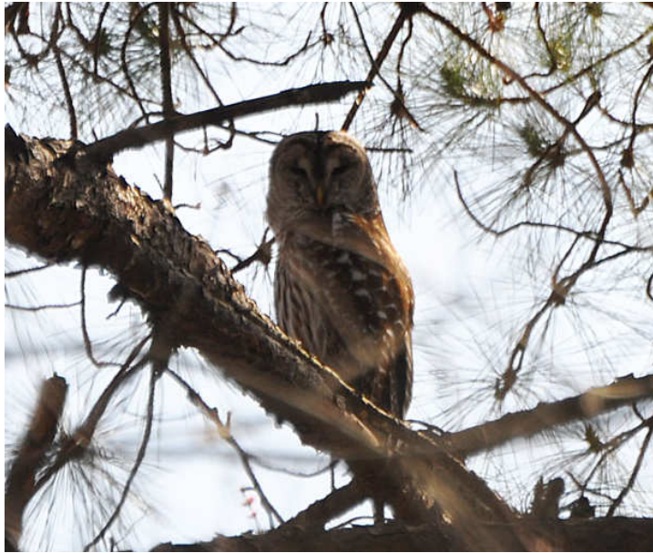
Barred Owl

Song Sparrow Swamp Sparrow White-throated Sparrow Dark-eyed Junco Northern Cardinal Red-winged Blackbird Eastern Meadowlark Common Grackle House Finch