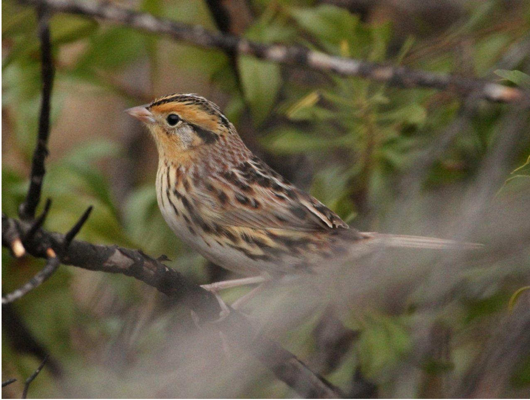
LeConte's Sparrow