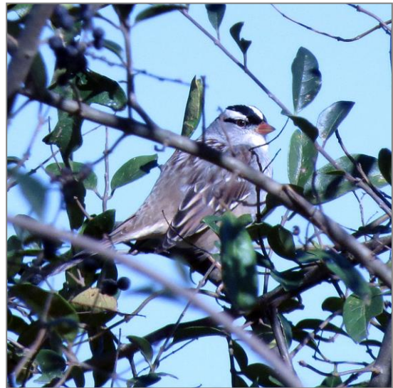
Northern Harrier and White-crowned Sparrow