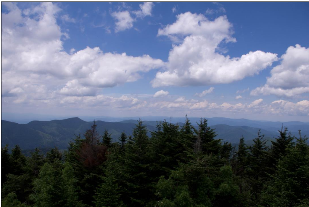
View from Mount Mitchell