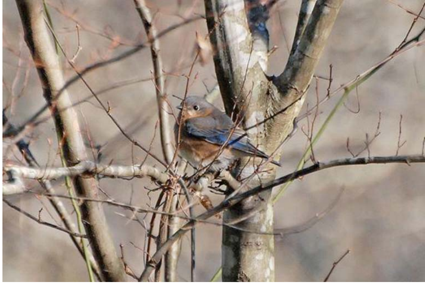
Eastern bluebird – Don Faulkner