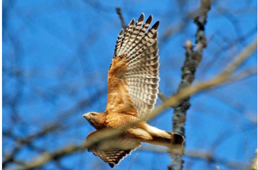
Red-shouldered hawk