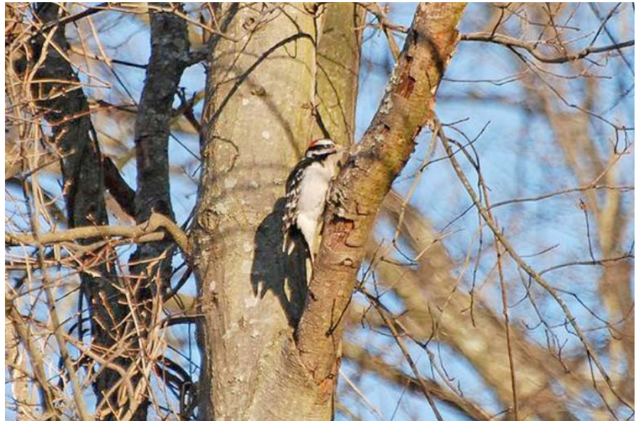
Hairy woodpecker