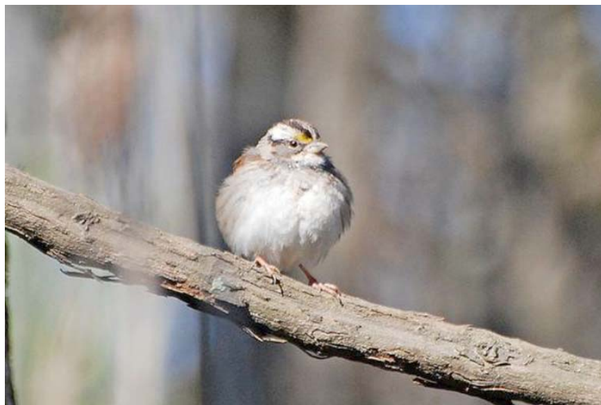
White throated sparrow – Don Faulkner

Cedar Waxwing American Goldfinch Tufted Titmouse Carolina Chickadee Carolina Wren Eastern Towhee Chipping Sparrow Field Sparrow Fox Sparrow House Sparrow Song Sparrow Swamp Sparrow White-throated Sparrow Golden Crown Kinglet Ruby Crown Kinglet White-breasted Nuthatch Brown headed Nuthatch Pine Siskin Pine Warbler Yellow rumped Warbler Dark-eyed Junco House Finch